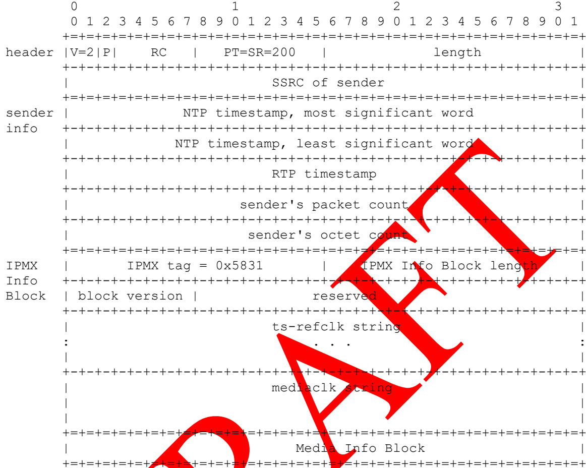
Figure 1 – RTCP Sender Report with IPMX Info Block extension

Note: A detailed description of fields in the header and sender info can be found in IETF RFC 3550 section 6.4.1